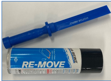
Plastic scraper Part No: 71-17262-00

To remove the old RTV please only use the following: