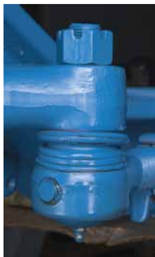
Patented purge valve tie rod end with sealed boot.