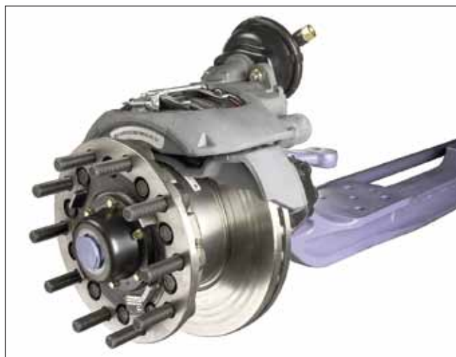
D-2000F shown with Bendix® ADB 22X air disc brake, Spicer® LMS™ hub and hub cap.